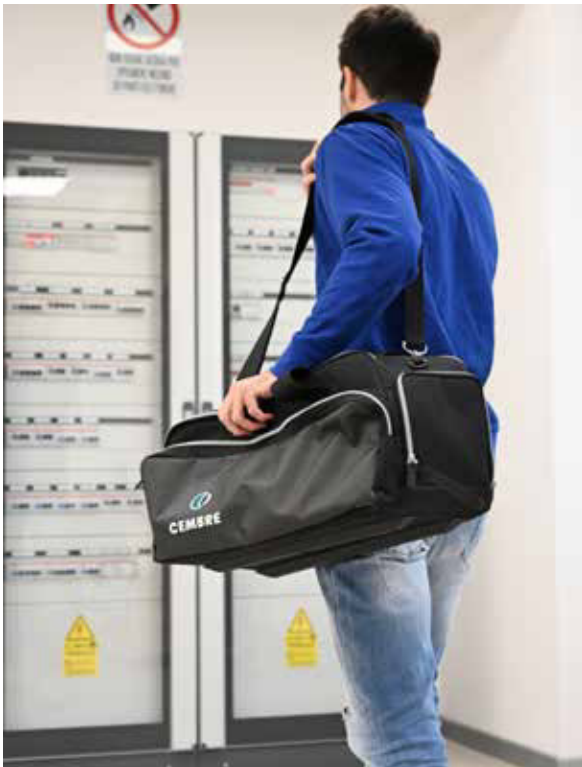
transport with soft bag CVB-039